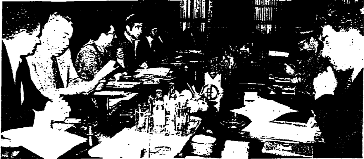
Acting Prime Minister Ze'evulun Hammer (fourth from left) chairs yesterday's cabinet session with only nine ministers present. The rest are in the U.S. for today's treaty signing ceremonies.

The consensus with regard to almost all the requested gestures towards Egypt was negative, but the nine ministers agreed that the Ministerial Committee on Security, whose members are now in Washington, should have a free hand to settle the matter of gestures.